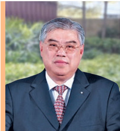
Hon Wong Ting-kwong, SBS, JP